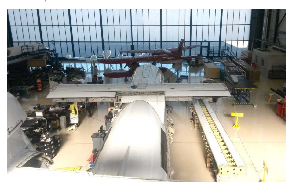
Figure 5: Rheinland Air Service (RAS)

The Observations of the practical part at Rheinland Air Service (RAS) Mönchengladbach were made on 29<sup>th</sup> January 2019.